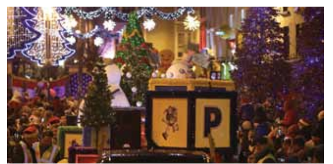
For information see www.christmasinkillarney.com

Parades begin on the 24th November and follow every Saturday, starting at 6pm. Make sure you get the best view of the parades just outside Café du Parc, or from inside The Tan Yard where the whole family can enjoy a festive meal while taking in all the action.